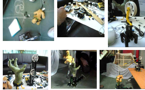
Fig.4 Remote Wild Animal Interaction Device

According to the analysed artefacts/artworks, designers are, in general, preoccupied with social interaction solutions.