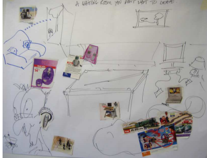
Fig.3 Dad waiting in a hospital with injured boy