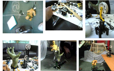
Fig.4 Remote Wild Animal Interaction Device

According to the analysed artefacts/artworks, designers are, in general, preoccupied with social interaction solutions.