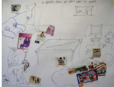
Fig.3 Dad waiting in a hospital with injured boy