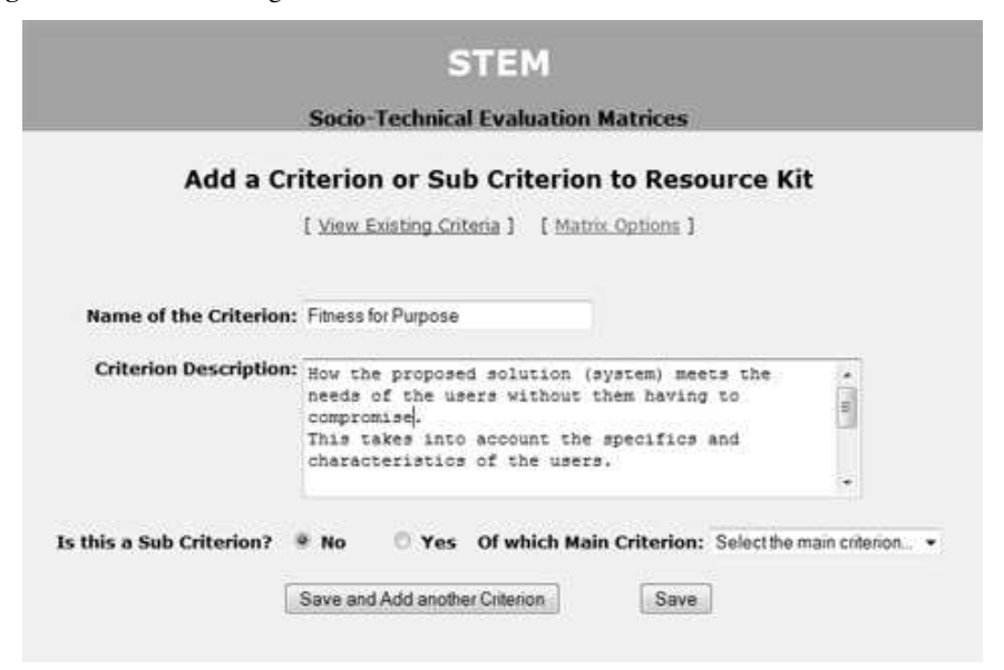
Figure 2: STEM - Defining criteria and sub criteria

These criteria, around which the discussion takes place, must be pre-defined by stakeholders. STEM therefore becomes more relevant as it allows partners to comment on the criteria according to their cultural sensitivity. Criteria are often defined and agreed upon during face to face meetings, telephone calls or emails. The administrator then adds these criteria into STEM and registers all participants to initiate the evaluation process.