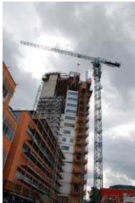
Fig. 1. Tornet (The Tower) during construction

The products which will be included in this study are plasterboards, doors and kitchens. The reasons why these particular products have been chosen are the following: plasterboards are chosen because of the common use of this product in the construction industry. Doors and kitchens are also chosen based on their commonality. Also, they have been subjected to delivery disturbances and quality problems for the examined construction site.