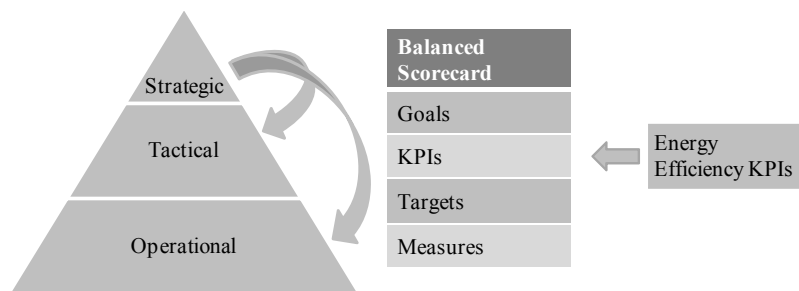
Fig. 2. The Balanced Scorecard and the different levels of companies' decision making

In the following we would like to propose an approach to integrate energy efficiency on the strategic level using the BSC. Because the BSC links strategic goals to operational measures, changes in the direction of energy efficiency reach out to all levels of the decision making process (see Fig. 2).