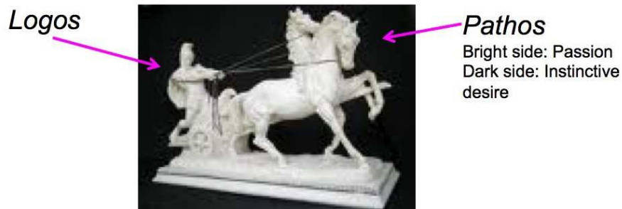
Fig. 2. Logos and pathos.

Here, we recall the ancient Greek origin of Western philosophy. Plato compared the human spirit to a carriage with two horses and one driver in his Republic [2]. Here, as illustrated in Fig. 2, the driver is a metaphor for the rational aspect of the human spirit, called the “logos.” On the other hand, the two horses are a metaphor for the emotional aspect, called the “pathos.” The former could be linked to the formal parts of our lives, and the latter, to the private parts. Furthermore, one of the horses represents passion, while the other represents the instinctive aspect of emotion.