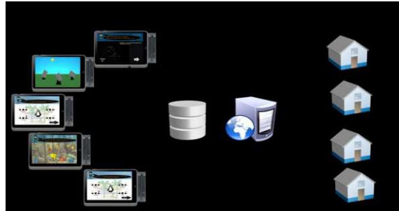
Fig. 1. System architecture connecting data collected from the mini-games in the Academy to the website accessible from home.

The experience begins when museum visitors create profiles on the California Academy of Sciences website. Initially they are able to personalize a limited number of characteristics of their avatars. Once they visit the museum, they play mini-games on iPad kiosks to accumulate points on their accounts. These points can then be redeemed at home by returning to the California Academy of Sciences website. Accessing the website from home allows the user to further personalize an avatar, learn more facts, and compare their scores on the mini-games and their avatar with those of their peers. Points can be redeemed to upgrade the avatar's available attributes and uniforms. The general system architecture can be seen in Fig. 1.