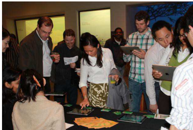
Fig. 5. Photograph from the opening at the California Academy of Sciences

From our opening on April 22, 2010, we had over 300 museum guests play with the iPad games (see Fig. 5). At both the user testing session as well as opening, much of the excitement came from the fact that they were getting to use a new technology. Many museum visitors would play the game based on the sole desire to try out the iPad.