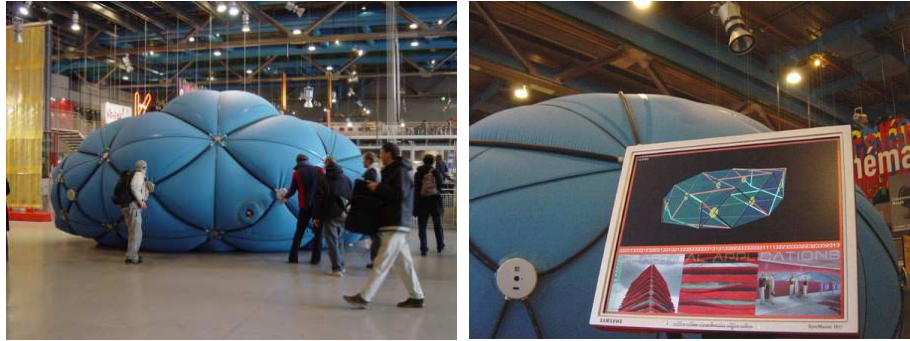
Fig. 2. Left: Visitors interacting with the NSA Muscle sensor nodes at the Centre Pompidou, Paris, 2003, Right: The NSA Muscle's real-time computational process being shown via a monitor at the NSA exhibition. The activity of the physical muscles is displayed in the digital world in real-time in three colors in the model: red / inflating state, blue / deflating state, and gray / passive state, and in the internally used organizational 72 digit string.