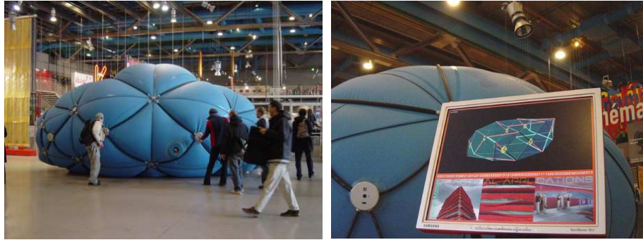
Fig. 2. Left: Visitors interacting with the NSA Muscle sensor nodes at the Centre Pompidou, Paris, 2003, Right: The NSA Muscle's real-time computational process being shown via a monitor at the NSA exhibition. The activity of the physical muscles is displayed in the digital world in real-time in three colors in the model: red / inflating state, blue / deflating state, and gray / passive state, and in the internally used organizational 72 digit string.