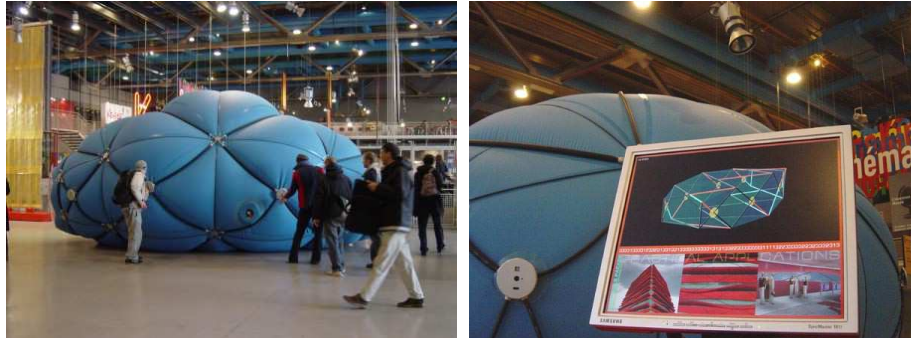
Fig. 2. Left: Visitors interacting with the NSA Muscle sensor nodes at the Centre Pompidou, Paris, 2003, Right: The NSA Muscle's real-time computational process being shown via a monitor at the NSA exhibition. The activity of the physical muscles is displayed in the digital world in real-time in three colors in the model: red / inflating state, blue / deflating state, and gray / passive state, and in the internally used organizational 72 digit string.