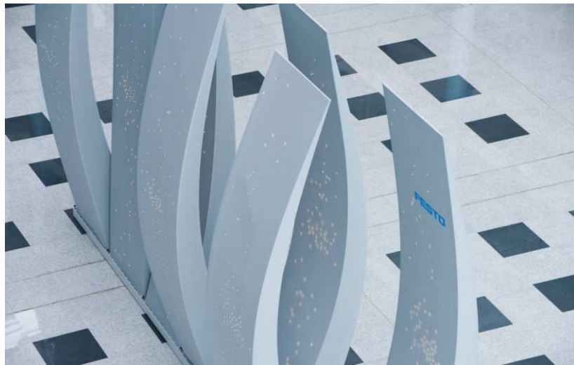
Fig. 5. Top: The InteractiveWall at the Hannover Messe 2009 displaying real time behavior by swinging its body back and forth, displaying patterns of light on its skin, and projecting localized sound.

User experience: The users interacting with the Emotive InteractiveWall experience the installation as an interactive system that exhibited emergent behavior and performed like a living system. The wall worked as an independent system built on synchronous behavior that is interrupted by the game-like response of multi-participant interaction. This layered system encourages the intended cycle of observation, exploration, modification, and reciprocal change in the participant, reinforcing believability in the system, and providing a sense of agency to the user.