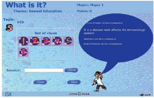
Figure 1: Student interface to the What Is it? sex education game.

We illustrate the potential of our approach by adding cultural support to a sex education quiz game called, What is it? The student's interface is shown in Figure 1. What is it? is a web quiz game where the player sees a topic with an associated secret word. Their task is to guess the word based on a series of clues that are shown one at a time. The objective is to guess the word after seeing the least number of clues. There are ten clues that can be selected by the learners by clicking on