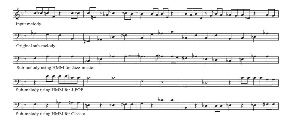
Fig. 2. Results of composing sub-melodies using various HMMs

song set for classical. All songs used in learning had four-four time. Namely, we prepared three categories of song sets to learn. In this experiment, we composed three sub-melodies with same input melodies using an HMM for jazz music, an HMM for J-POP, and an HMM for classical. We prepared a song from the "RWC Music Database: Jazz Music Database" that was not used in learning as an input melody. Part of the input melody, the original sub-melody (for reference), and the sub-melodies composed by the proposed system using each HMM are shown in Fig. 2. Although the input melodies are the same, the sub-melodies composed by using the proposed system are different due to using different HMMs.