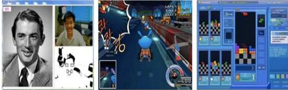
Fig. 3. Games with Face Components Recognition (FCR) Interface (a) Smile like Hollywood star (b) Kart-Rider serviced by NEXON, and (c) Tetris by NHN