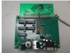
Fig. 1. Keyboard Signal Generation Board

Finally, the board enters the keyboard signal according to the received command into PC.