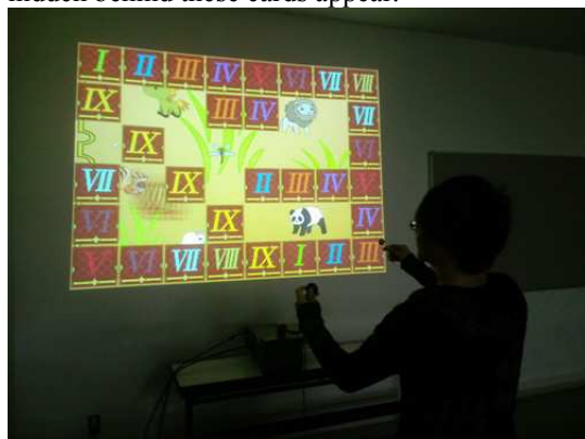
Fig. 3. A product example of an application using gesture input by an infrared camera.

A product example of applications using gesture input by an infrared camera is shown in Figure 3. This is an amusement in which cards displayed on a wall are moved by gestures. The card overlapped with a marker goes away at random and an image hidden behind these cards appear.