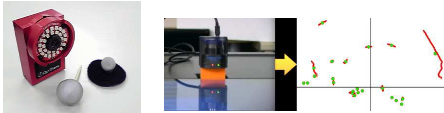
Fig. 1. An infrared camera and markers(left) and data detected by a near-infrared radar(right).

The near-infrared radar rotates laser beams 36 times per second with a 0.36-degree pitch in fan-shaped flat space with radius 4 m and central angle 240-degree, and can acquire the data of directions and the distances to objects by detecting the reflected laser beams from the surface of the objects. The positions of the objects are calculated from these data (figure 1).