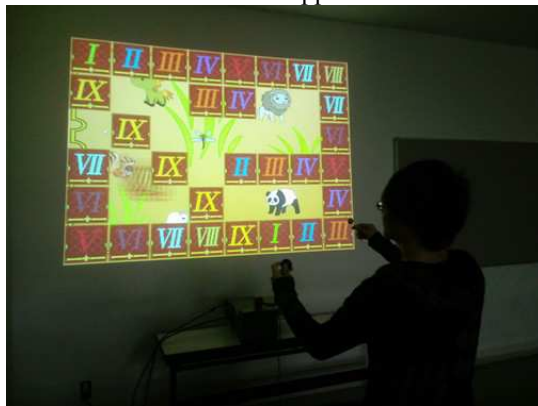
Fig. 3. A product example of an application using gesture input by an infrared camera.

A product example of applications using gesture input by an infrared camera is shown in Figure 3. This is an amusement in which cards displayed on a wall are moved by gestures. The card overlapped with a marker goes away at random and an image hidden behind these cards appear.