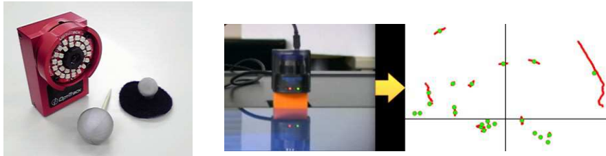
Fig. 1. An infrared camera and markers(left) and data detected by a near-infrared radar(right).

The near-infrared radar rotates laser beams 36 times per second with a 0.36-degree pitch in fan-shaped flat space with radius 4 m and central angle 240-degree, and can acquire the data of directions and the distances to objects by detecting the reflected laser beams from the surface of the objects. The positions of the objects are calculated from these data (figure 1).