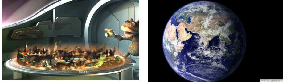
Fig 3. Screenshots from 80Days' game demonstrator.