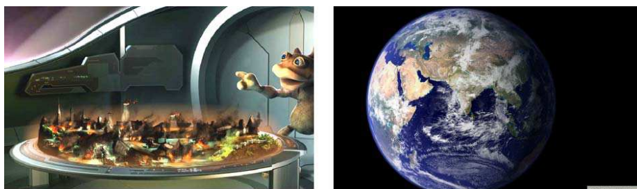
Fig 3. Screenshots from 80Days' game demonstrator.