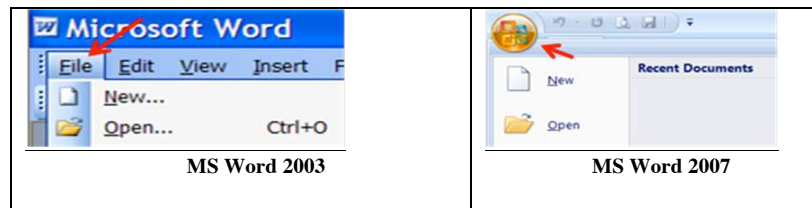
Figure 1. Type 1 Violation