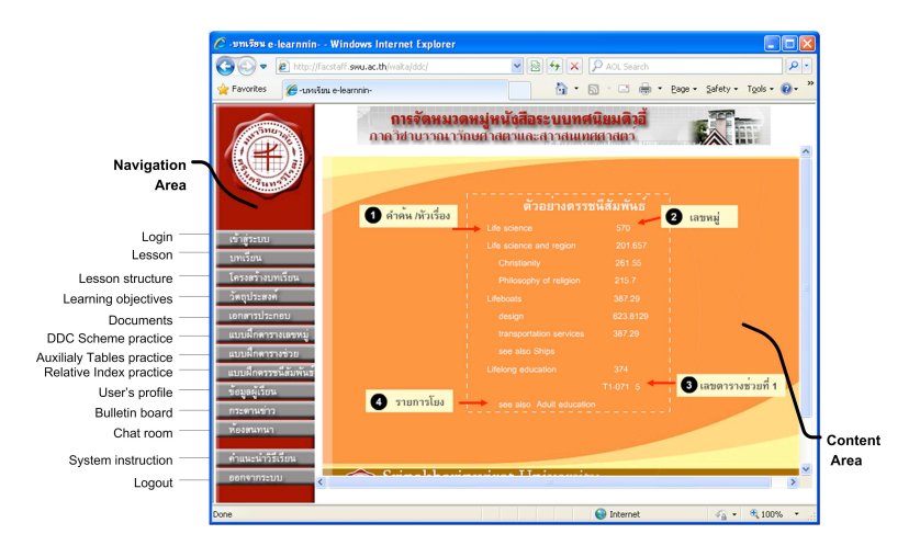
Figure 3. Learning webpage design