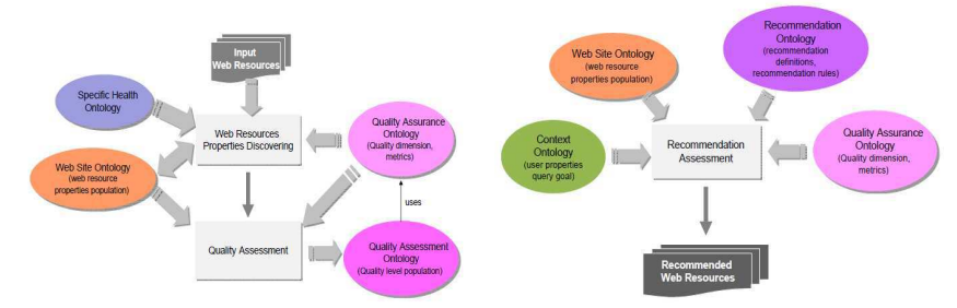
Fig. 3. Salus Quality Assessment

The evaluation of the recommendation rules is based on the user profile, the quality level of the considered web resources and the query resources. Both, the user profile and the web resource quality level, have been calculated in the previous two phases. Query resources have to be discovered at this moment. The output of this phase is a set of recommended web resources to a particular user query. The figure 4 summarizes the recommendation assessment phase.