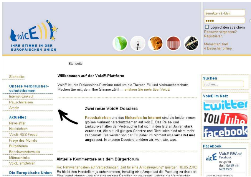
Fig. 1. Screenshot of www.bw-voice.eu (accessed in May, 2010)

screenshot of the German platform. The feasibility of such an approach is of particular importance, as the follow-up project VoiceS 3 continues the aims of the VoicE project (which was finished in December, 2009) and complements the platform by adding a series of new features such as a serious game and semantics [2]. This way, VoicE and VoiceS incorporate ongoing evaluation (as recommended by [3]) in an iterative design cycle [4].