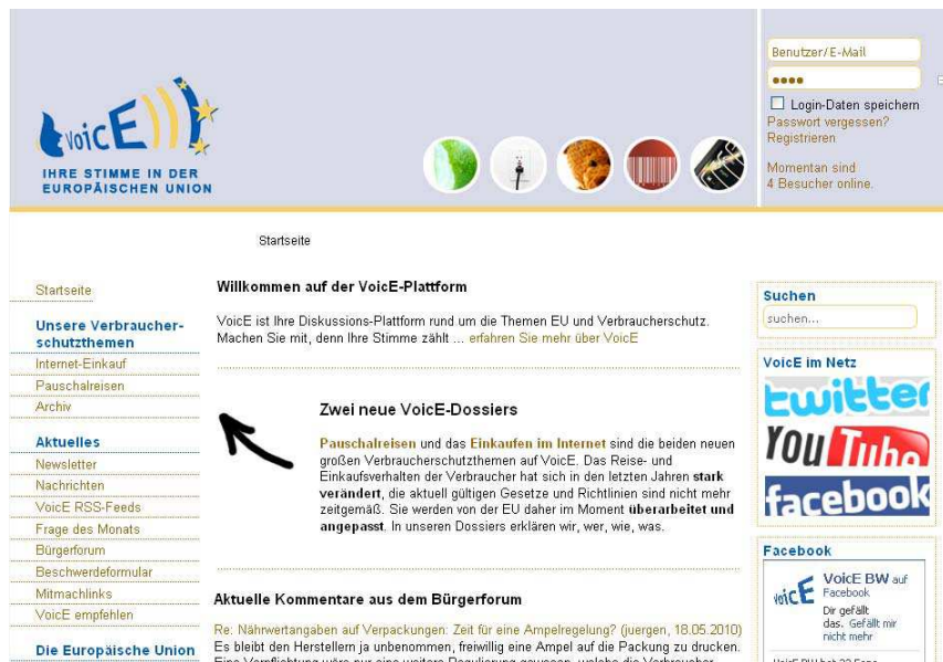
Fig. 1. Screenshot of www.bw-voice.eu (accessed in May, 2010)

screenshot of the German platform. The feasibility of such an approach is of particular importance, as the follow-up project VoiceS 3 continues the aims of the VoiceE project (which was finished in December, 2009) and complements the platform by adding a series of new features such as a serious game and semantics [2]. This way, VoiceE and VoiceS incorporate ongoing evaluation (as recommended by [3]) in an iterative design cycle [4].