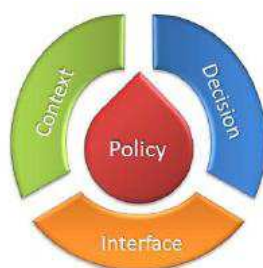
Fig.1. The elements of a Padget

In particular, as we can see in Figure 1 a Padget is composed of four elements: