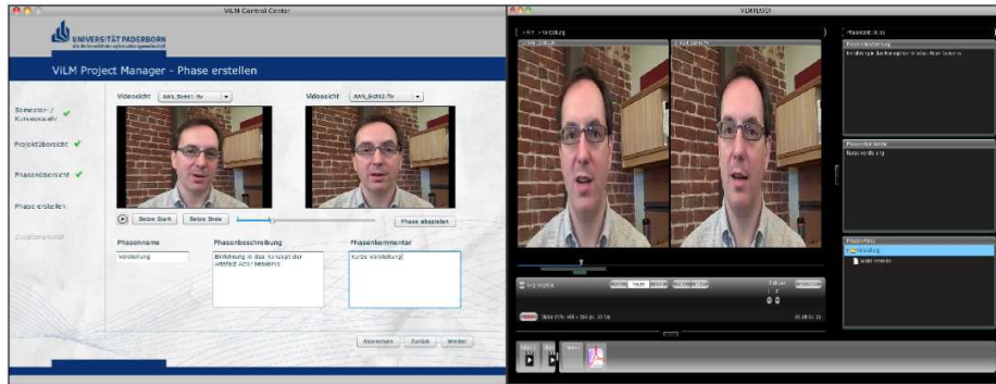
Fig. 2: Screenshots of a project in the ViLM ControlCenter (left) and the ViLM player (right)