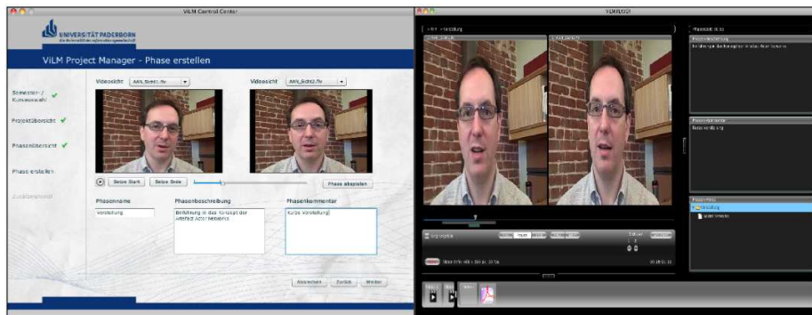
Fig. 2: Screenshots of a project in the ViLM ControlCenter (left) and the ViLM player (right)