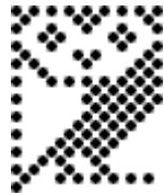
Fig. 1. Logo of the BBC Computer Literacy Project

The BBC micro was put on sale, and additionally the British government Department of Trade and Industry arranged to place one into every school, since the advent of microelectronics was expected to have a major impact on commerce and work. The Department of Education set up a series of national advisory units which continue today as Becta (formerly the British Educational Communications and Technology Agency). Production was discontinued in 1994 by which date over one million BBC Micros had been sold in the UK and Europe [3].