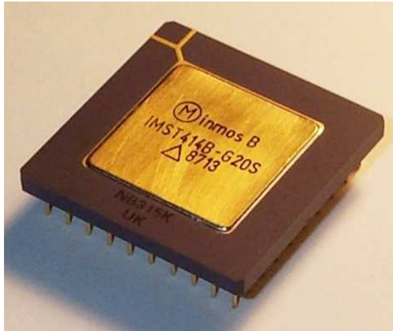
Fig. 3. A Transputer chip [19]

An alternative was offered by the Transputer from Inmos [16] from 1983 [17]. Inmos Limited was a British semiconductor company, founded by Iann Barron, based in Bristol and incorporated in November 1978. Inmos ceased trading, and many staff moved to SGS-Thomson (now STMicroelectronics) in April 1989 and was fully absorbed by 1994 [18].