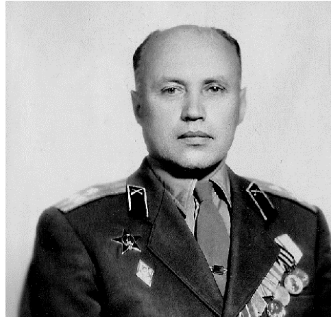
Fig. 1. Colonel Anatoly Kitov, scientific head of Computer Centre № 1 of the USSR Ministry of Defense (1959).

programmers, 85 information analysts, 40 mathematicians (specialists in mathematical modeling), several hundreds specialists in computer engineering worked on specialized and universal computer projects.