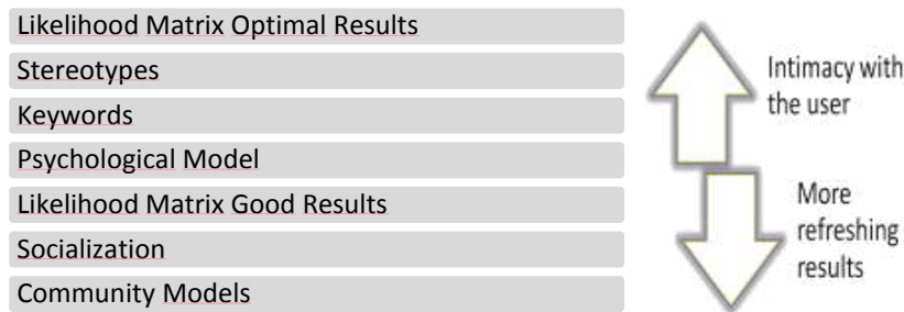
Fig. 1. Recommender System's Techniques

Although tourism systems are more than a mere RS, that is the most important step regarding the user point of view, since the underlying mechanisms are invisible to them. Contrary with what the state of the art may make us think, adapting the system to accommodate user's preferences and needs can be accomplished using a variety of techniques. Figure 1 presents all techniques contemplated in the devised RS, as well as their importance.