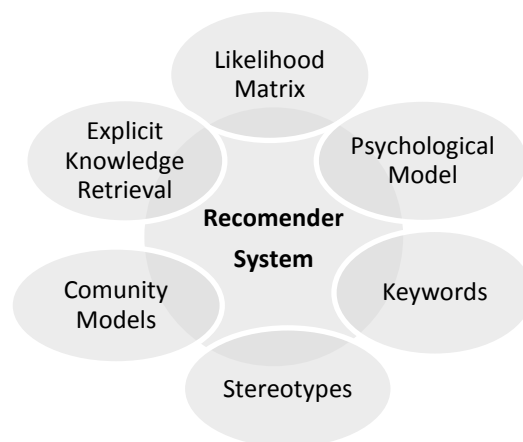
Fig. 2. Knowledge Discovery Mechanisms' Architecture

As it was earlier implied, a powerful RS is endorsed by several techniques that maximize the accuracy of the necessary user information in a variety of ways. Our UM methodology (which backs up the RS) must therefore be a collaborative effort of several sub-systems, each of them responsible for the retrieval of part of user data. Furthermore, it is also believed that knowing a certain user information space by using more than one method simultaneously successfully increases confidence in existent assumptions and divides responsibility amongst various techniques, which ultimately results in a system with more solutions and contingency plans [2][3][4]. This knowledge retrieval spirit represents the true evolution of our system against the considered state of the art. The system's knowledge discovery components can be observed in Fig. 2.