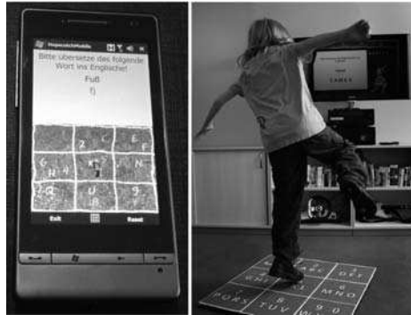
Fig. 2. HOPSCOTCHpad (left) and HOPSCOTCHmobile (right)

Because of the small display of mobile phones additional feedback is very important. Different sounds for any field and the use of vibration generates haptical and acoustical feedback. Correct spellings are rewarded with short animations.