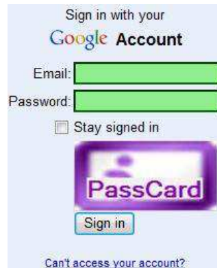
Fig. 3. PassCard logo