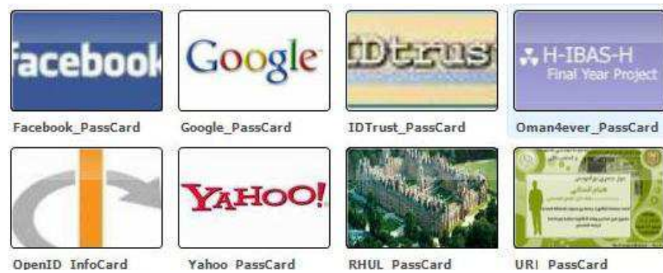
Fig. 2. PassCards

Prior to, or during, use of the CPM, the user invokes the CIdS and creates a PassCard, inserting their username in the firstname field and password in the lastname field. Optionally, the user could also insert the URL of the target website in the web page field 6 (see Sect. 3.2). For ease of identification, the user can give the PassCard a meaningful name, e.g. of the corresponding website. The user can also upload an image for the PassCard, e.g. containing the logo of the intended site. Example PassCards are shown in Fig. 2.