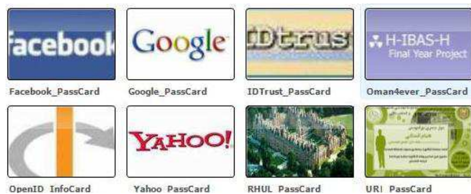
Fig. 2. PassCards

Prior to, or during, use of the CPM, the user invokes the CIdS and creates a PassCard, inserting their username in the firstname field and password in the lastname field. Optionally, the user could also insert the URL of the target website in the web page field 6 (see Sect. 3.2). For ease of identification, the user can give the PassCard a meaningful name, e.g. of the corresponding website. The user can also upload an image for the PassCard, e.g. containing the logo of the intended site. Example PassCards are shown in Fig. 2.