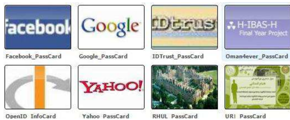
Fig. 2. PassCards

Prior to, or during, use of the CPM, the user invokes the CIdS and creates a PassCard, inserting their username in the firstname field and password in the lastname field. Optionally, the user could also insert the URL of the target website in the web page field 6 (see Sect. 3.2). For ease of identification, the user can give the PassCard a meaningful name, e.g. of the corresponding website. The user can also upload an image for the PassCard, e.g. containing the logo of the intended site. Example PassCards are shown in Fig. 2.