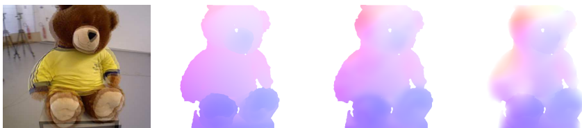
Fig. 2. Camera motion. From left to the right : a) Input images. b) Optical flow of the rigid motion estimation. c) Optical flow using the proposed method. d) Optical flow by the scene flow method [13]. Results of the proposed method are clearly more accurate than those of [13].

this scene presents a changing 3D motion field due to the translation and rotation of the sensor. We first estimate a single rigid motion as is presented in Sec. 4.4. We estimate the parameters using every second pixel with a range between 50 cm and 150 cm from the sensor. At each level of the pyramid we run 100 iterations. This result is taken as baseline and compared in Figure 2 with resulting optical flows of our method and the dense estimation provided by [13]. The proposed method produces a close estimation of the camera motion without assuming a global rigidity of the scene. In contrast, the direct regularization on the scene flow components, as is performed in [13], fails to capture the diversity of 3D motions introduced by the camera rotation.