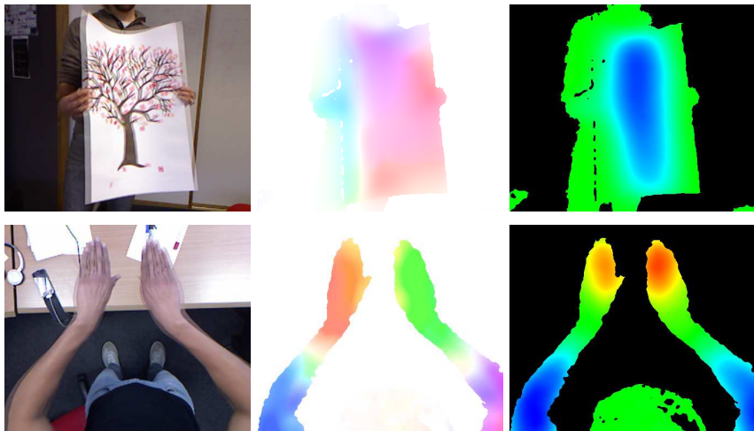
Fig. 1. Scene flow estimation with a fixed camera. a) Left : Input images. b) Middle : Optical flow c) Right : Z-component of the scene flow.