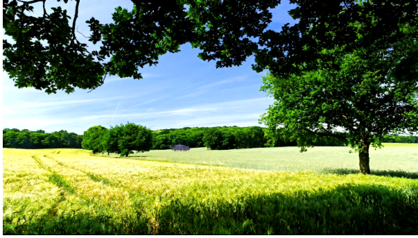
(a) Variant #1 of video sequence