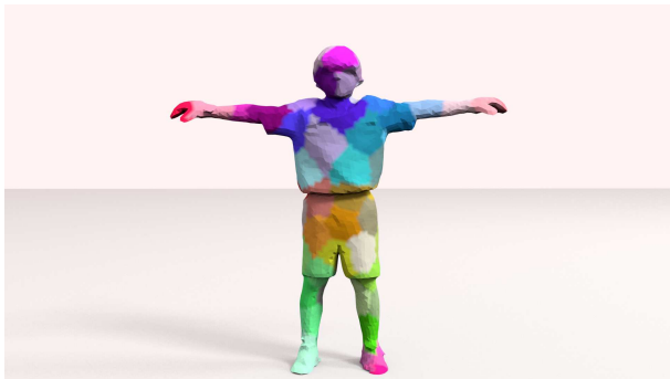
Fig. 1. Example of patch template used.

We assume given a temporal sequence of 3D reconstructions, incoherent meshes or point clouds, obtained using a multi-view reconstruction approach, e.g. [12,1,20]. We also assume that a template mesh model of the scene is available, e.g. a particular instance within the reconstructed sequence under consideration. The problem of local surface rigidity and mean pose analysis is then tackled through the simultaneous tracking and intrinsic parameter estimation of the template model. We embed intrinsic motion parameters (e.g. rigidities) in the model, which control the motion behavior of the object surface. This implies that the estimation algorithm is necessarily performed over a sub-sequence of frames, as opposed to most existing surface tracking methods which in effect implement tracking through iterated single-frame pose estimation. We first describe in details the geometric model (§3.1) illustrated with Fig. 1, and its associated average deformation parameterization for the observed surface (§3.2). Second, we describe how this surface generates noisy measurements with an appropriate Bayesian generative model (§3.3). We then show how to perform estimation over the sequence through Expectation-Maximization (§3.4).