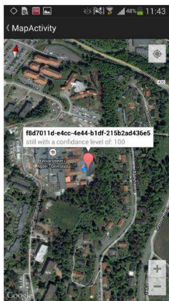
Figure 2 A screen shot of a subscriber's map

As previously mentioned, there are two parts to the SmartRescue development: the mobile app part and the web-based part. The development of the SmartRescue app is currently adapted to smartphones running android 4.0 and above; this covers 72% of android phones on the market. We use the Android Developer Tools (ADT), a plugin for Eclipse IDE. For testing our publisher and subscriber apps, we use a Samsung Galaxy S4 GT-I9505, which has the Android 4.2.2 operating system, with Quad-Core processor of capacity 1.9 GHz. One of the main reasons for using this smartphone is that it is equipped with barometer, thermometer and humidity sensors. In addition several Google APIs are employed (i.e. location and sensor APIs, Google Map API v.2, and activity recognition API), which allowed us to access the necessary sensors tested in our project. Regarding the monitoring platform, we have developed a web subscriber that performs the same role as the mobile phone subscriber, which can be seen as a chart and map visualization. Google Map API v.3 is used for the web-based map. The publisher's location, light condition and the user activity can be captured from this web-based map. The additional feature is that the data captured by web subscribers is stored in the database. Currently, we employ Mongo DB for storing the data.