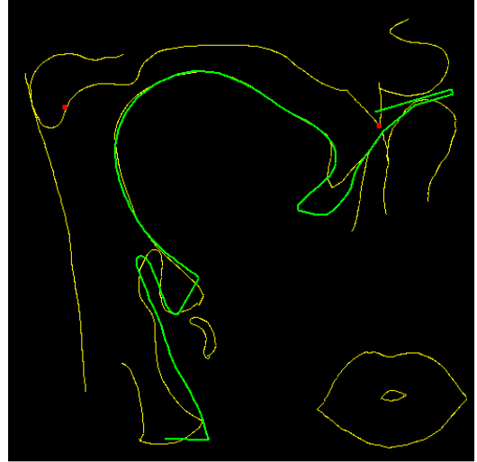
Figure 1: Fitting of the tongue model. A new speaker VT contours delineated by hand in yellow. Model contour in green. The larynx and the lip are also represented.

The evaluation of this adaptation procedure has been carried out on the corpus C3. The model has been adapted to the