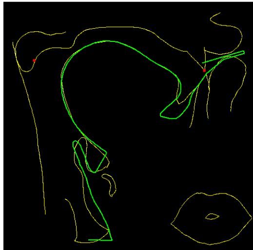
Figure 1: Fitting of the tongue model. A new speaker VT contours delineated by hand in yellow. Model contour in green. The larynx and the lip are also represented.

The evaluation of this adaptation procedure has been carried out on the corpus C3. The model has been adapted to the