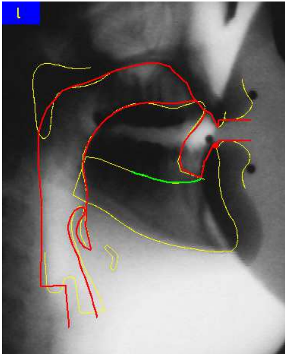
Figure 4: Example of tongue approximation of an /l/. Yellow contours are original contours. The approximated VT contour is represented by the red line.

Even if the adaptation method proposed can easily be applied to the last model, the articulatory coordinates, i.e. the weight of each linear component, are speaker dependent because they are also related to the palate shape. We will now connect the acoustic simulation with the articulatory model instead of the vocal tract shapes derived directly from X-ray images (Laprie, Loosvelt, et al. 2013). Beyond articulatory synthesis, this will enable the investigation of the compensatory effects linked with the palate shape (Brunner et al. 2006).