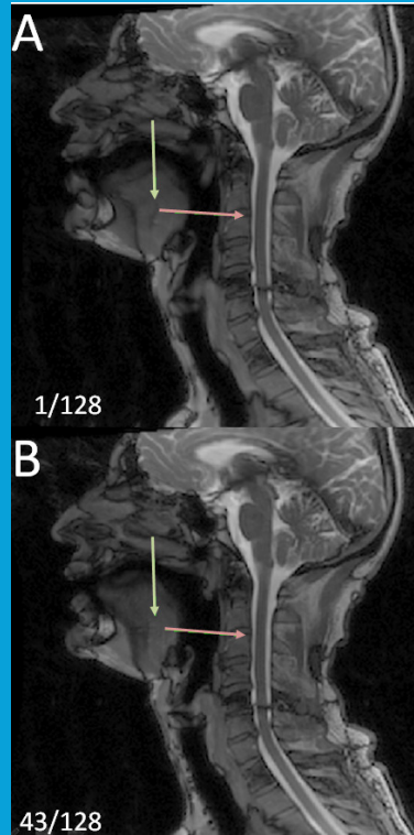
Fig.1 A sagittal slice with two time frames (A) and (B) from a reconstructed template sentence cine loop.