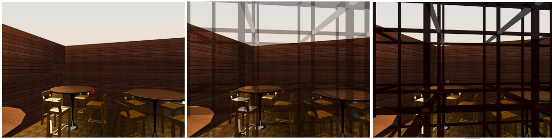
Figure 1: From left to right: In the tracking zone of a CAVE-like system, in order to warn a user not to hit the real wall, the motion workspace [14] is represented in the virtual world by a 3D grid which becomes clearer and sharper when the user goes closer to the display screen or his/her hand reaches out close to it.