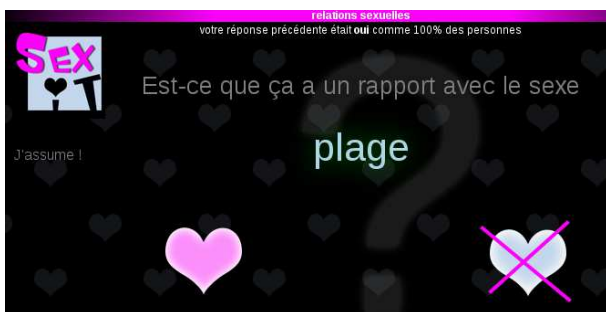
Figure 3: SexIt: is “beach” (plage) related to sex?

SexIt 5 allows players to identify a term as being related to sex or not (see an example in figure 3, for “beach”). It is a pseudo game : there is no score, no ranking, no gain, only a poll-like comparison with other players. It is played only because the topic is fun: we would have had more difficulties collecting data on taxation, for example. This is an important limitation for language resource building using that kind of interaction. Collecting information about vocabulary related to sex can be necessary, for example to detect pornographic contents. However, such information is insufficient for discriminating pornography from courses in biology, reproduction or anatomy which, while not being pornographic, contain their share of sex-related terms.