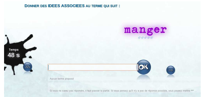
Figure 1: JeuxDeMots: give ideas associated with “manger” (to eat).

The principle behind JeuxDeMots is quite straightforward: players are asked to enter ideas associated with a term chosen by the system (see figure 1). Players get points if they have answers in common with other players. The more original the answer, the more points are rewarded, but the higher the risk of having no intersection at all with others.