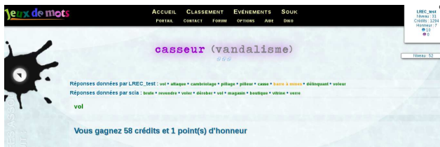
Figure 2: JeuxDeMots: recap of a game involving “casseur” (hooligan).

A galaxy of pseudo games (the definition is given in section 2.2.) were created around JeuxDeMots, including mainly LikeIt 1 , AskIt 2 or ColorIt 3 , that add information to the network. SexIt is one of them.