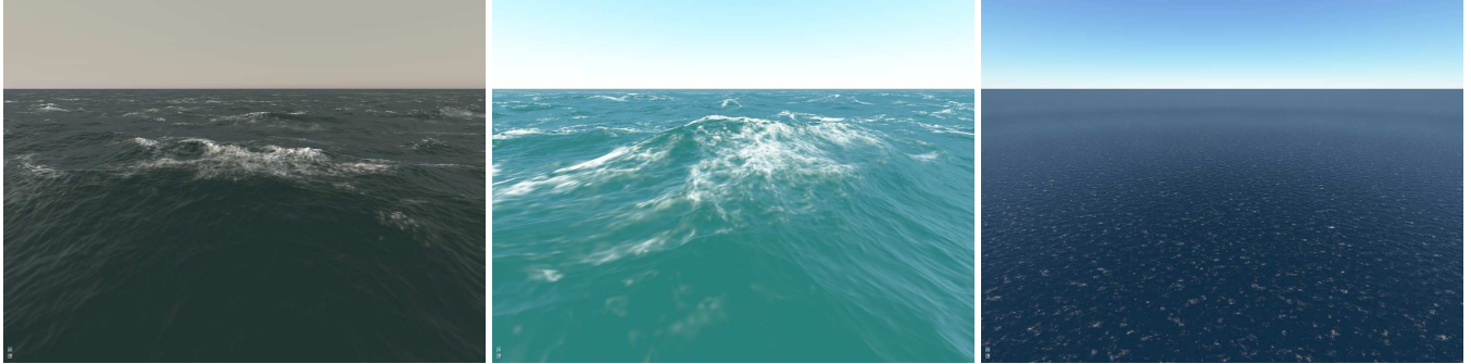
Figure 1: Some real-time results obtained with our method showing large ocean scenes with whitecaps under different wave and illumination conditions. The whitecap contribution is correctly averaged as the viewing distance increases.

INRIA Grenoble Rhône-Alpes, Université de Grenoble et CNRS, Laboratoire Jean Kuntzmann Université de Lyon, CNRS Université Lyon 1, LIRIS, UMR5205, F-69622, France