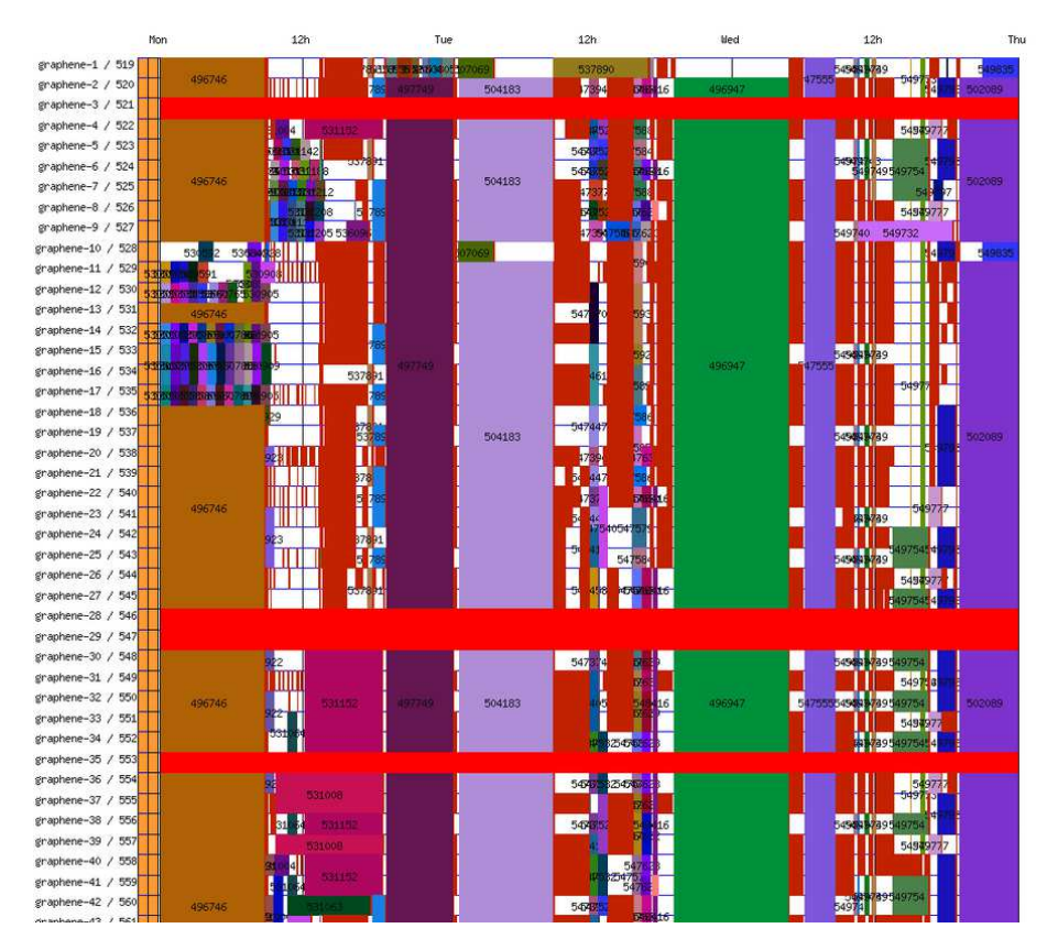
Fig. 5. Visualization of the usage of a Grid'5000 site using a Gantt diagram.

other hand, with OAR, each node can be associated with a number of properties, that can later be used to request resources fulfilling specific needs, as shown in Figure 4. This enables users to request resources matching specific properties, rather than rely on explicit naming of requested resources: the burden of filtering resources for specific user requirements is transferred from the user to the resource manager.