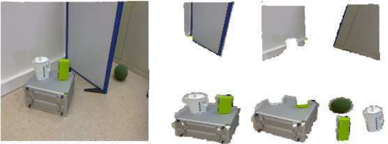
Fig. 3. Example of the segmentation with the baseline system. Left: original point cloud after re-sampling. Right (upper row): detected walls which are subsequently removed. Right (lower row): Segmented objects including objects placed on top of each other. The whole group is segmented as a single object at first. Detection of the horizontal plane on the metal suitcase allows to separate the suitcase from the three objects placed on top of it.

on the database to evaluate the performances. The evaluation metrics are the pixel-wise precision and recall.