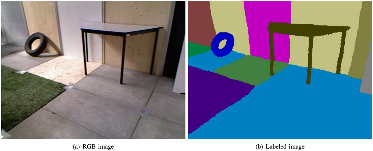
Fig. 2. Examples of image annotations in the PACOM RGBD segmentation database. (a): Original image. (b): annotated image. Each pixel has an identity associated to it, where different pixel colors indicate different identities.