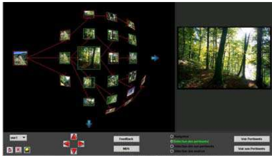
Figure 2 : Example of the "fish eye" view of a part of a session.