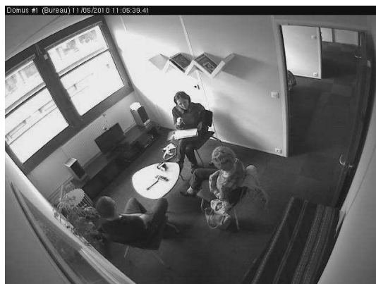
Fig.1. Each test was composed of an interviewer, a wizard and a couple of one elderly person with a relative (except for one senior who was alone) inside the DOMUS smart home of the LIG Laboratory 1

The participants consisted of 18 persons from the Grenoble area. Among them, 8 were in the senior group, 7 in the relatives group (composed of mature children, grandchildren or friends). The mean age of the elderly group was 79.0 (SD=6.0), and 5 out of 8 were women. These persons were single and perfectly autonomous. In order to acquire another view about the interest and acceptability of the project system, 3 professional caregivers were also recruited to participate in the experiment (2 nurses and one professional elderly assistant).