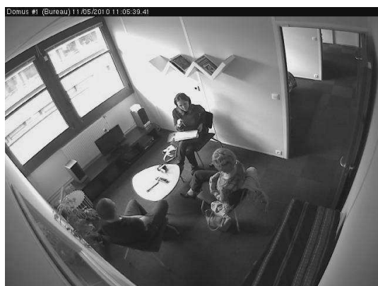
Fig.1. Each test was composed of an interviewer, a wizard and a couple of one elderly person with a relative (except for one senior who was alone) inside the DOMUS smart home of the LIG Laboratory 1

The participants consisted of 18 persons from the Grenoble area. Among them, 8 were in the senior group, 7 in the relatives group (composed of mature children, grandchildren or friends). The mean age of the elderly group was 79.0 (SD=6.0), and 5 out of 8 were women. These persons were single and perfectly autonomous. In order to acquire another view about the interest and acceptability of the project system, 3 professional caregivers were also recruited to participate in the experiment (2 nurses and one professional elderly assistant).