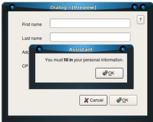
Figure 1. A help message leads the user through the UI.

model-to-code compilation rules [2]. However, whatever the approach is (MDE or MB-UIDE), none of the automatically generated UI have enough quality, forcing designers to manually tweak the generated UI code [2]. Design knowledge can not be always explicitly represented into the models, but it has a potential to help users. Some of the models of the MDE approach as for instance the task model have this potential explicitly represented, and they can contribute also to guide and help the user.