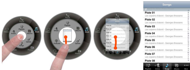
Figure 3: Long lists management: the linear list appears in the center of the Wavelet menu and is surrounded by its parent menus.

The Wavelet menu is an adaptation of the Wave menu for mobile devices. Our prototype has been designed to explore and navigate multimedia data. It thus appears in the center of the device screen (Figure 1) and contains five items corresponding to frequently used multimedia categories: Music, Photos, YouTube, Videos and Phone. More categories could be added if needed as the root menu can contain up to eight items. Second-level submenus contain three to six subcategories depending on the selected parent item. For instance, the Music category (Figure 2) is divided into: Albums, Music Styles, Songs, Podcasts, Artists, Playlists and Albums.