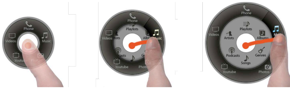
Figure 2: The Wavelet menu appears centered around the contact point. By drawing a stroke towards the desired item, the first level is enlarged permitting progressive appearance of the submenu. A second stroke selects an item in the submenu.

This paper presents the Wavelet Menu (Figure 1), a new menu technique that was developed as an attempt to answer some of the problems described above. The Wavelet technique is an improvement of hierarchical Marking menus [6] that is specifically designed for mobile devices. Its design is inspired by Multi-Stroke [13] and Wave menus [1], as explained below.