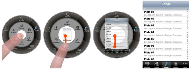
Figure 3: Long lists management: the linear list appears in the center of the Wavelet menu and is surrounded by its parent menus.

The Wavelet menu is an adaptation of the Wave menu for mobile devices. Our prototype has been designed to explore and navigate multimedia data. It thus appears in the center of the device screen (Figure 1) and contains five items corresponding to frequently used multimedia categories: Music, Photos, YouTube, Videos and Phone. More categories could be added if needed as the root menu can contain up to eight items. Second-level submenus contain three to six subcategories depending on the selected parent item. For instance, the Music category (Figure 2) is divided into: Albums, Music Styles, Songs, Podcasts, Artists, Playlists and Albums.