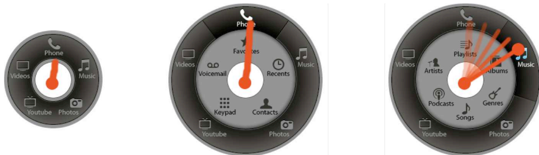
Figure 4: Exploration in Wavelet menus: the user can browse all submenus by performing a continuous circular gesture.

Finally, when sufficient space is available, Wavelet menus also provides the advantage of previsualization. The user can then make a continuous circular gesture to browse all submenus as shown in Figure 4. Submenus are automatically displayed when the stylus (or the finger) hovers over the corresponding item in the parent menu. This makes it possible to browse the menu system in