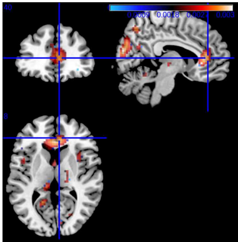
FIGURE 1. Caption: A visualization of the areas of the brain identified as being discriminative between cocaine addicted and control subjects. The rostral anterior cingulate cortex is prominent in the selected areas implicating a role in cocaine addiction (Gkirtzou et al., ISBI 2013).

A focus of research in our group has been on the development of methodologies for neuroscientific studies, rather than simply providing an answer to a specific question. We are therefore addressing applications to several neurological disorders, including Alzheimer's disease and autism. Our work is greatly assisted through collaboration and integration with multiple partners on the Saclay Plateau, and assisted by resources made available to support such integration. Wacha Bounliphone is a doctoral student jointly funded by Centrale and Supelec, and cosupervised by Matthew Blaschko (Centrale & Inria) and Arthur Tenenhaus (Supelec). Her doctoral research is focused on statistical tools for the integration of neuroimaging and genetics information. Such tools are essential to understanding both the neural and genetic mechanisms of Alzheimer's, and the statistical tools developed will be immediately applicable to multi-modal data analysis across a wide range of domains.