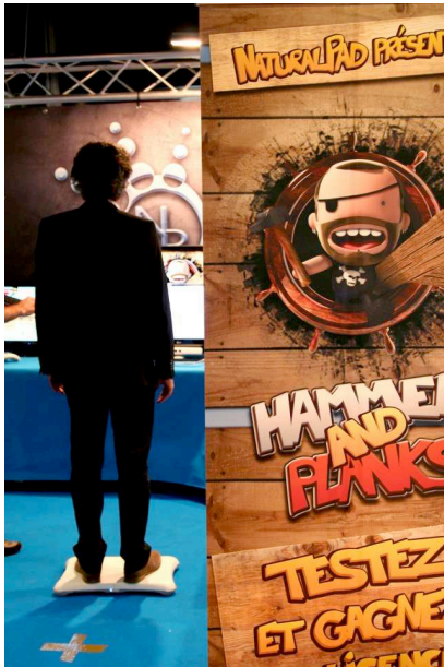
Figure 3. Hammer and Planks used with a Wiiboard in the MIG event

As we said we tried to avoid every kind of discrimination towards non healthy players. As Hammer and Plank is a competitive game we created a generic leaderboard to aggregate all the players. The opportunity of this choice will be discussed in the next section. During the event we added as additional motivator a final price for the best score in the leaderboard which consisted in one license of the game.