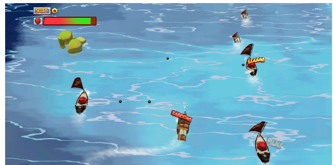
Figure 2. A screenshot from Hammer and Planks.

This kind of game is suitable for high scoring as players seek to improve their performance primarily on criteria such as the number of enemies killed. The gaming experience typically expected in this kind of game is based on a high level of challenge. The phases of the game are generally intense, short but requiring a lot of concentration. Enemies and obstacles arrive in large numbers and it is an important part of the game to respond quickly and staying attentive. Also the idea behind the boat improvement is linked to the patient's rehabilitation: as a player he rebuilt his boat in the game, as a patient he do the same with his own body.