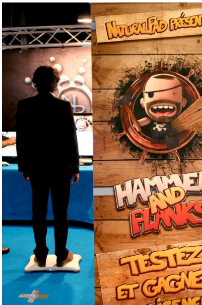
Figure 3. Hammer and Planks used with a Wiiboard in the MIG event

As we said we tried to avoid every kind of discrimination towards non healthy players. As Hammer and Plank is a competitive game we created a generic leaderboard to aggregate all the players. The opportunity of this choice will be discussed in the next section. During the event we added as additional motivator a final price for the best score in the leaderboard which consisted in one license of the game.