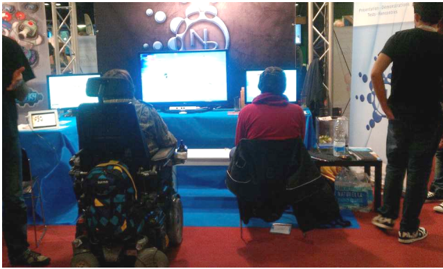
Figure 2. Different players playing together

Another 10 years old boy came on Saturday and was back at 10am (the opening hour) on Sunday. He stayed on the stand until we ended up saying that even without being in the high score, he would be entitled to his free license.