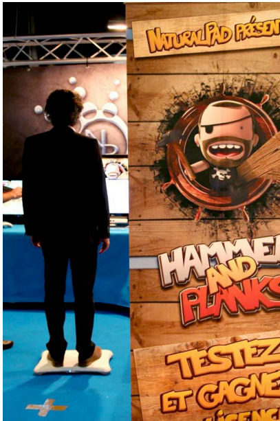
Figure 3. Hammer and Planks used with a Wiiboard in the MIG event

As we said we tried to avoid every kind of discrimination towards non healthy players. As Hammer and Plank is a competitive game we created a generic leaderboard to aggregate all the players. The opportunity of this choice will be discussed in the next section. During the event we added as additional motivator a final price for the best score in the leaderboard which consisted in one license of the game.