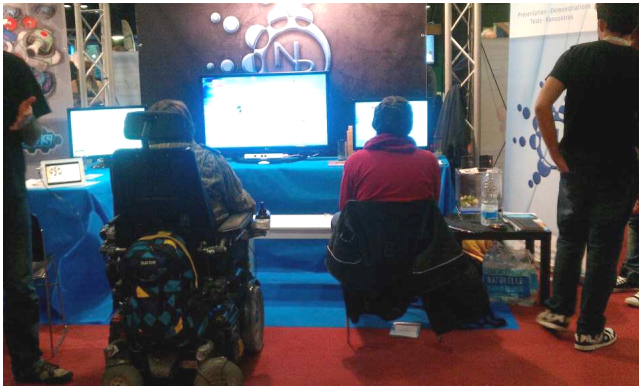
Figure 2. Different players playing together

Another 10 years old boy came on Saturday and was back at 10am (the opening hour) on Sunday. He stayed on the stand until we ended up saying that even without being in the high score, he would be entitled to his free license.