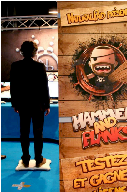
Figure 3. Hammer and Planks used with a Wiiboard in the MIG event

As we said we tried to avoid every kind of discrimination towards non healthy players. As Hammer and Plank is a competitive game we created a generic leaderboard to aggregate all the players. The opportunity of this choice will be discussed in the next section. During the event we added as additional motivator a final price for the best score in the leaderboard which consisted in one license of the game.