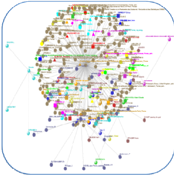
FIG.2: CENTRAL NUCLEUS AND SATELLITE CONNECTIONS IN WS PROCESSING.

Based on the analysis of the semantic networks, we observe that the center of the graph (or the central nucleus) consists of terms related to the decision-making analysis: the process completed at first time in the EI process.